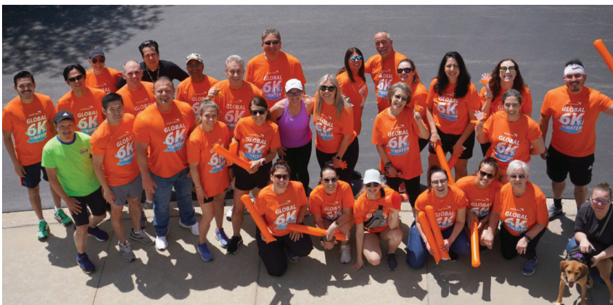
Gerber employees in the U.S. and Canada participate in World Vision’s 6K Walk/Run for water to provide clean water to children in communities around the world